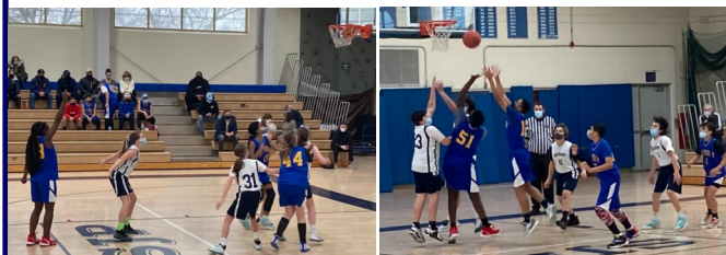
A great basketball season