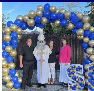
A special First Day of School visit from Pope Saint Pius V himself!