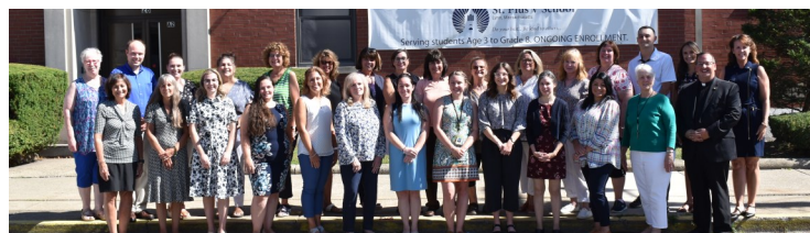
Our 2022-2023 faculty!