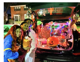
School and parish "Trunk or Treat" Event