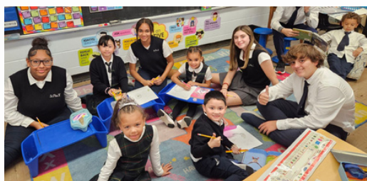
Grades 1 and 8 spending time reading with their 'buddies'