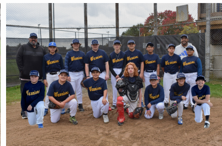
We are so excited that baseball and softball have returned to the St. Pius V Athletics program!