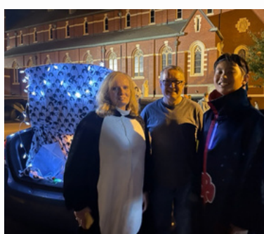
Our 3rd annual Trunk or Treat event was great fun for our families and community!