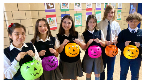
For our Fall Charity Project, we collected donations for St. Jude's Children's Hospital