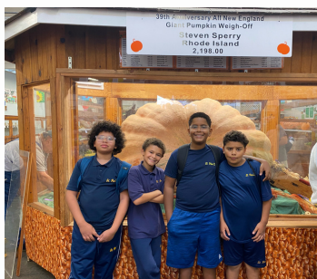
Grade 5 on their field trip to the Topsfield Fair