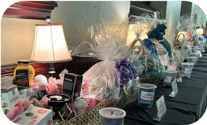
Making a comeback after 5 years, our April Silent Auction Fundraiser was a great success! We hope to see you at next year's event!