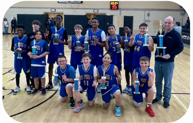
Our JV Boys Basketball team won the NSCESBL Championship this year!