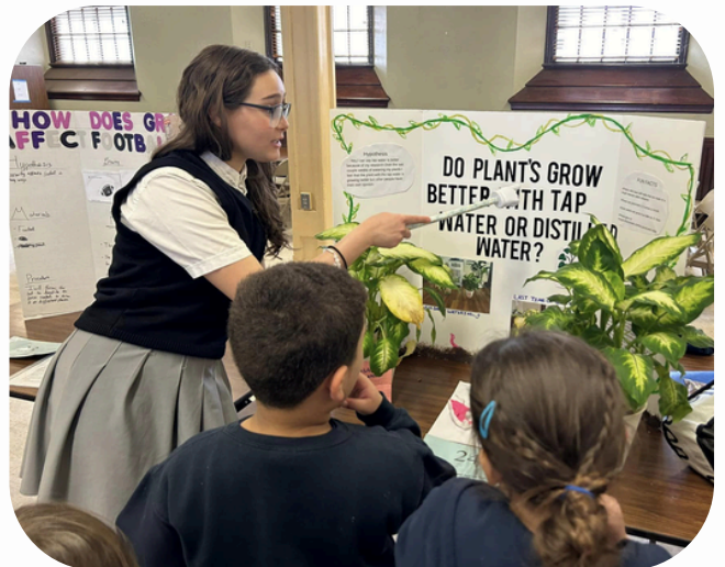
Student presented some impressive projects at our Science Fair!