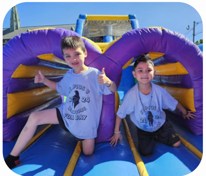
Our annual Fun Day was a blast, as usual! Thank you to our PTO!