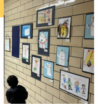
Art Fair - 1995 and 2024