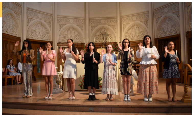
Student Council Inauguration - 1989 and 2024