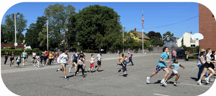
Students helped raise money for our school in this spring's Jogathon!