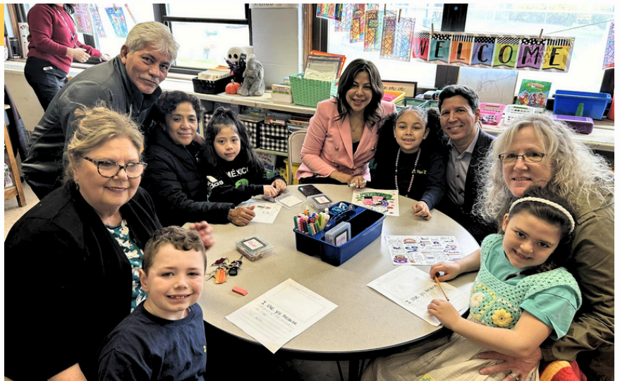
Grandparents Day - 1986 and 2024