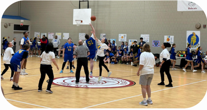
Our 2nd Annual Faculty vs Students Basketball Game was an exciting night that raised funds for our Athletic program!