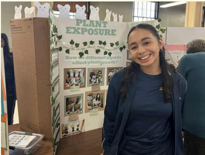
6 th and 7 th graders came up with awesome experiments for our annual Science Fair