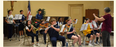
Our band groups gave a great performance at our spring band concert