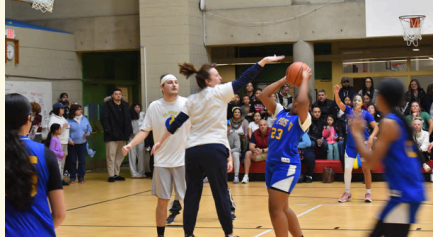
School faculty played against the Girls and Boys Varsity Basketball teams to raise money for our Athletics Program