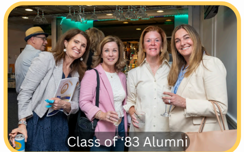
Class of '83 Alumni