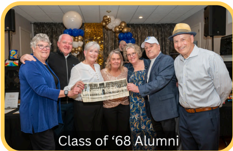
Class of '68 Alumni

If you missed this event and want to stay informed of future events, please fill out our contact information form so we can stay in touch!