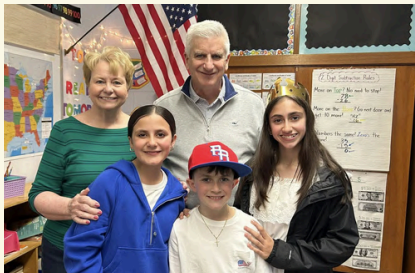
Grandparents Day is still one of our favorite St. Pius V School traditions!