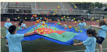
We wrapped up the school year with Fun Day at Manning Field