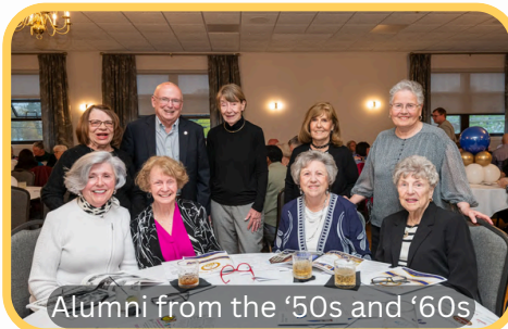
Alumni from the '50s and '60s