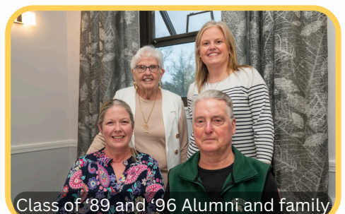
Class of '89 and '96 Alumni and family