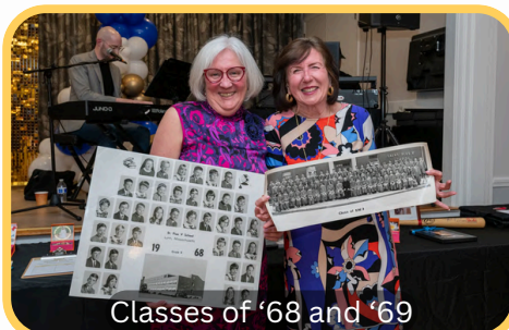
Classes of '68 and '69