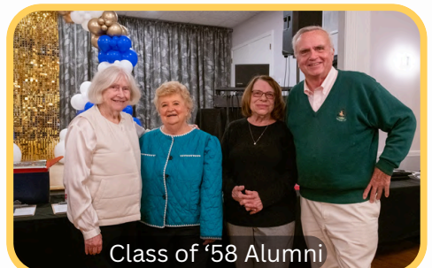
Class of '58 Alumni