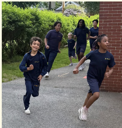
Students raised money for enrichment activities at our annual Jogathon