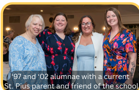
'97 and '02 alumnae with a current St. Pius parent and friend of the school