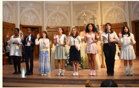
We welcomed our newly elected 2025-2026 Student Council Executive Board at our Inauguration Ceremony