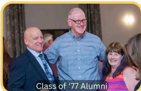
Class of '77 Alumni