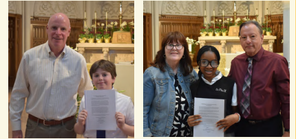
23 students and faculty members received scholarships for next school year, thanks to our generous benefactors