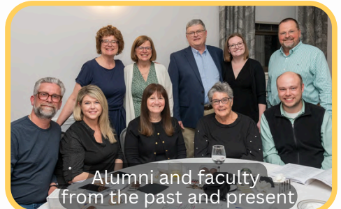
Alumni and faculty from the past and present