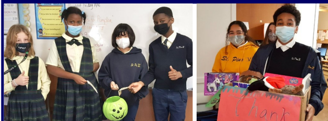
School-wide charity projects