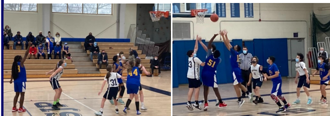
A great basketball season so far