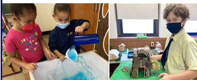
Hands-on learning in every grade